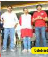
Celebrity @ GMIU