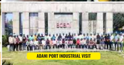
ADANI PORT INDUSTRIAL VISIT