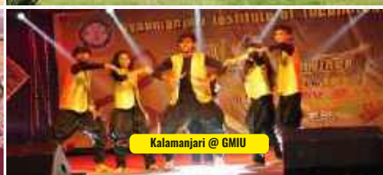
Kalamanjari @ GMIU