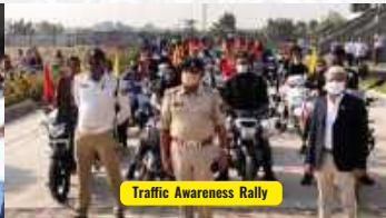
Traffic Awareness Rally