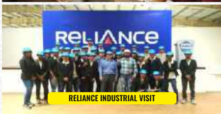
RELIANCE INDUSTRIAL VISIT