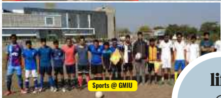
Sports @ GMIU