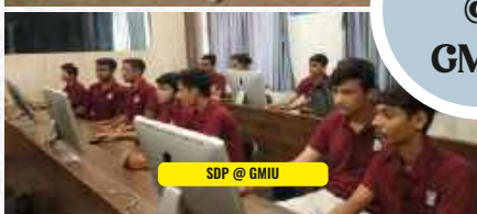
SDP @ GMIU