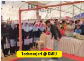
Techmanjari @ GMIU