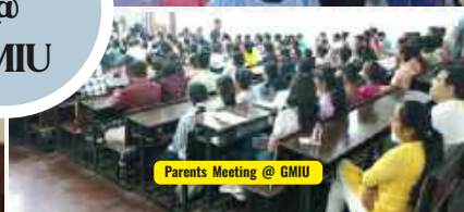
Parents Meeting @ GMIU