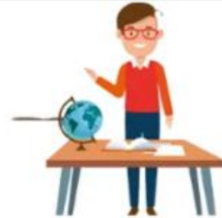
TEACHERS & PROFESSORS