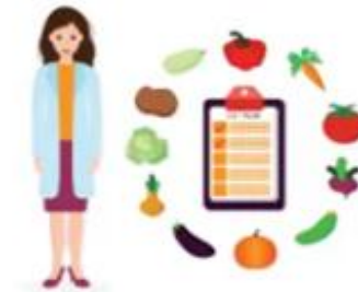
DIETICIANS & NUTRITIONISTS