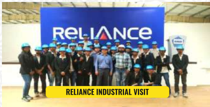
RELIANCE INDUSTRIAL VISIT