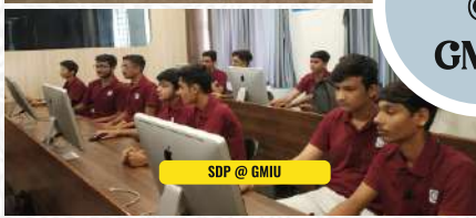
SDP @ GMIU