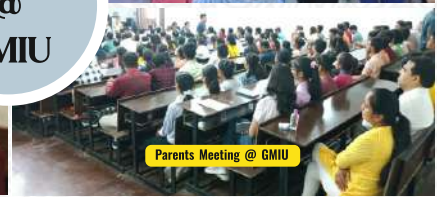
Parents Meeting @ GMIU