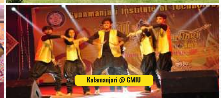
Kalamanjari @ GMIU