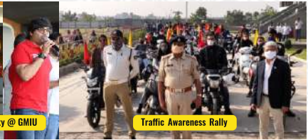
Traffic Awareness Rally