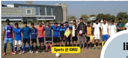
Sports @ GMIU