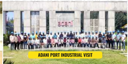
ADANI PORT INDUSTRIAL VISIT