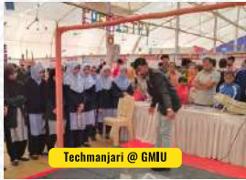
Techmanjari @ GMIU