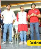
Celebrity @ GMIU